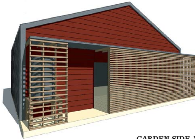
GARDEN SIDE VIEW