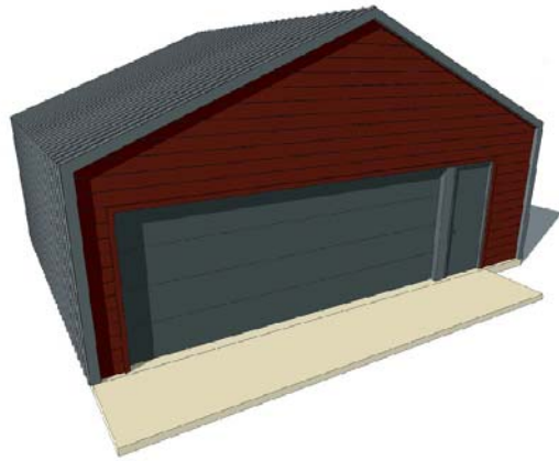
ALLEY SIDE VIEW