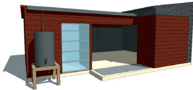
GARDEN SIDE VIEW