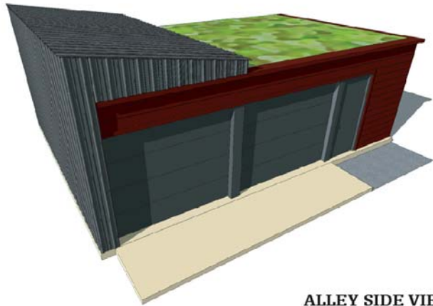
ALLEY SIDE VIEW