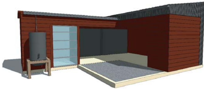
GARDEN SIDE VIEW