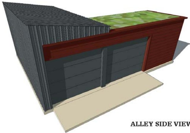
ALLEY SIDE VIEW